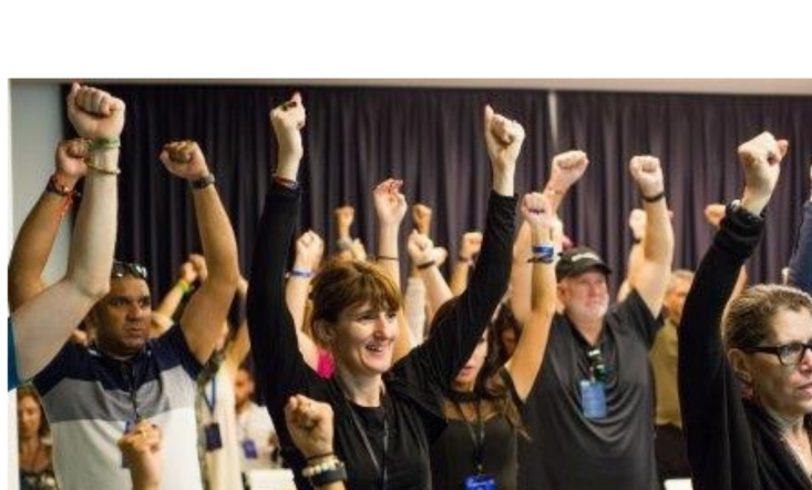
Participants do the Blow Out in Dondi's Five Elements workshop at Awesome Fest in Ibiza, Spain